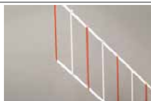
Skirt kit (*) length 3 m (only for standard rectangular beam)