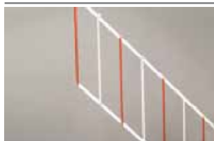
Skirt kit (*) length 2 m (only for standard rectangular beam)