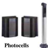
Photocells and Columns page 189