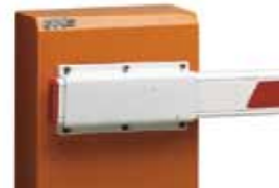
Fastening pocket for rectangular beam