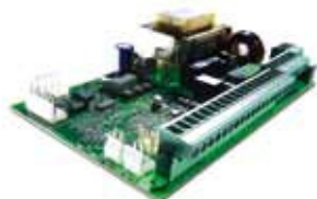
Built-in control board 596/615 BPR Technical specifications page 158