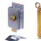
Various accessories page 194